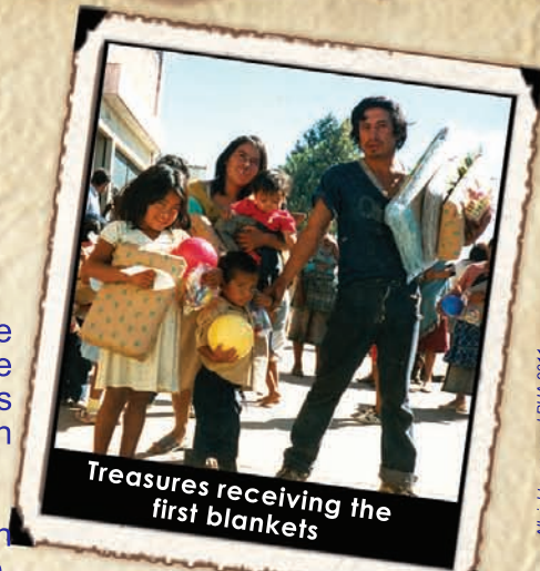
All rights reserved PHA 2011