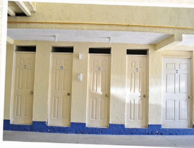
Phase 2: Bathrooms