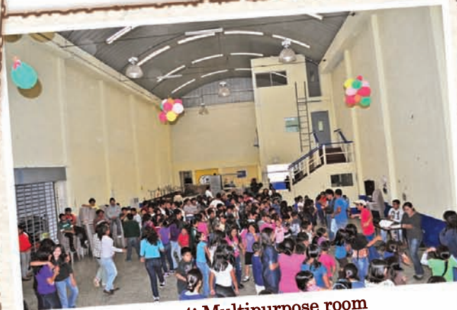
Phase 4: Multipurpose room