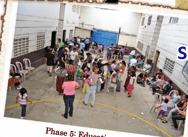
Phase 5: Education center