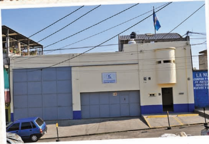
Phase 1: Front entrance and perimeter wall